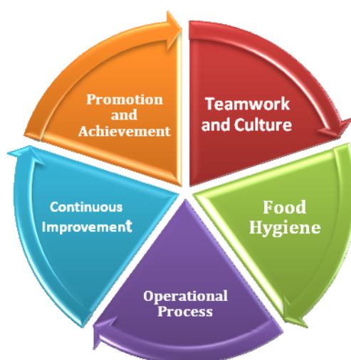
Figure 2: Value drivers

There must be certain key drivers in place to enable quality services. Based on years of management experience and insight from experts and consultants, and also reference to the international management concepts encompassing “Man”, “Machine”, “Material”, “Method” and “Continuous Improvement” as framework, five value drivers are identified as the key elements of service management. The framework is illustrated below.